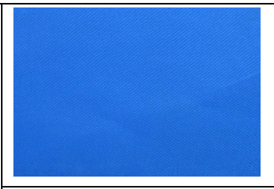
Item NO AB015 600D Oxford cloth