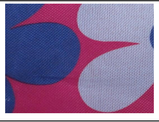
Item NO AB015 600D Oxford cloth