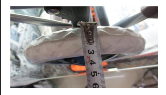
Item NO AB015 wheel