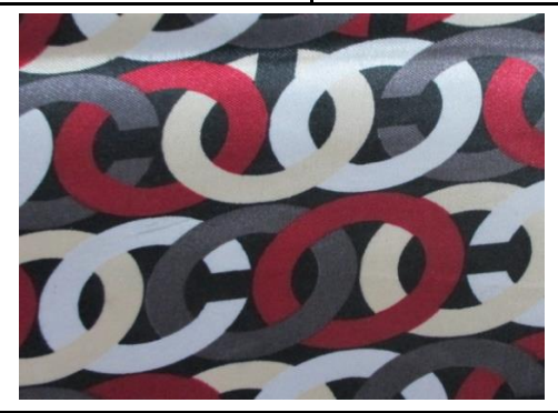
Item NO AB014 Satin cloth