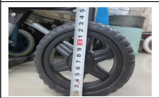
Item NO AB019 as picture